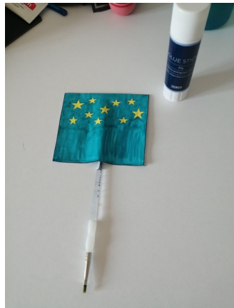
5. Glue the two halves together