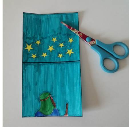
2. Cut round the edge of the picture