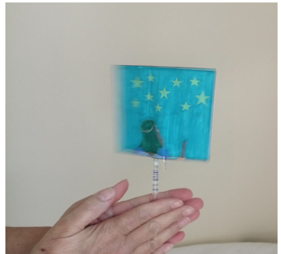
6. Spin the picture to see Abraham and the stars together