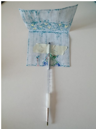
4. Tape a stick or skewer or paintbrush or pen to the back of the picture